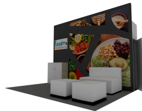
Design subject to change without notice

It is equipped with 1 wall with printed graphic, cellar with door and key, 1 counter with printed graphic, 1 double armchair and 2 stools.