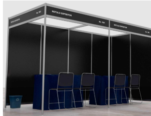
Design subject to change without notice

Fully equipped with 2 tables, 6 chairs, carpet and fascia board