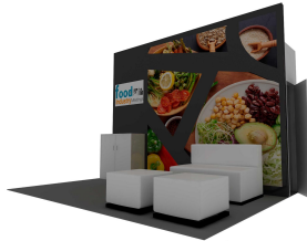
Design subject to change without notice

It is equipped with 1 wall with printed graphic, cellar with door and key, 1 counter with printed graphic, 1 double armchair and 2 stools.